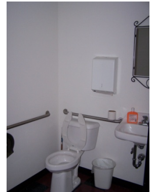
Adjoining ADA Keyed Bathroom

Located in the lowest level of the Monroe Professional Center Condominium, immediately adjacent to an at-grade project entrance, Unit B108 is an efficiency office. The ADA compliant entry door features a sidelight that allows natural light into the space. Heat is provided by an electric furnace. The unit features in wall wiring for telephone and computer.