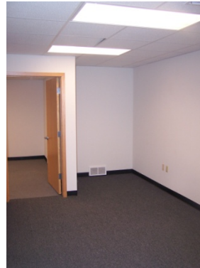
Clerical and waiting room