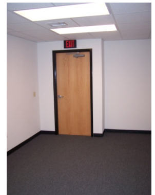
Main entrance to clerical

Located in the lower level of the Monroe Professional Center Condominium, Unit B103 features two large offices [17'5" x 12' & 16'7" x 12'] and a comfortably sized clerical and waiting area [17'5" x 9'10"]. One office has its own private entrance from the hallway and can be secured from the remainder of the space making Unit B103 an ideal space for an office sharing arrangement. All doors are ADA compliant and interior walls are insulated to minimize sound transmission. The unit is heated by an electric furnace. Both offices and the clerical area are wired for telephone and computer.