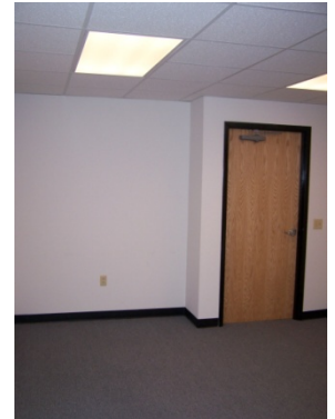
South office & 2 nd exit