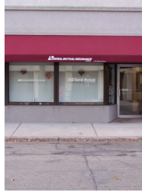
10 th Street exposure