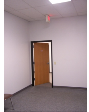
Conference room & 2nd exit