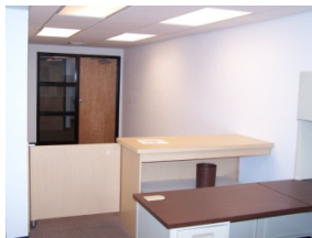
Reception from west