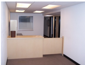
Reception from east