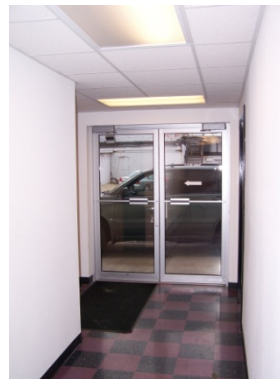
South project exit