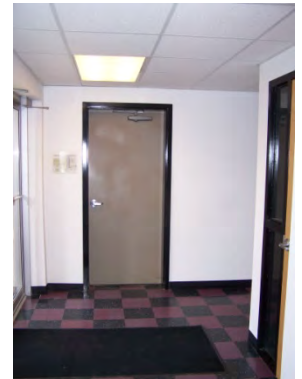
Entrance from hallway

Located in the lowest level of the Monroe Professional Center Condominium, Unit B107 is a large single vehicle garage with room for storage shelving on both sides of a parked vehicle. Vehicle entrance is from the south. The unit has a floor drain and a hose faucet that delivers both hot and cold water.