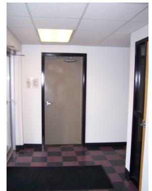
Entrance from hallway

Located in the lowest level of the Monroe Professional Center Condominium, Unit B107 is a large single vehicle garage with room for storage shelving on both sides of a parked vehicle. Vehicle entrance is from the south. The unit has a floor drain and a hose faucet that delivers both hot and cold water.