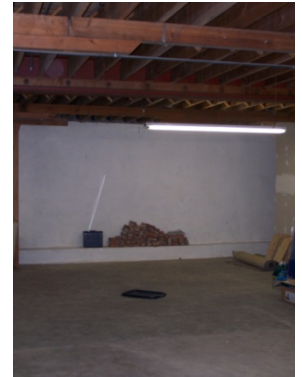
Floor and ceiling