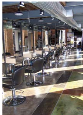
Lower level workstations