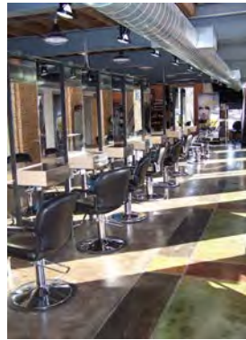
Lower level workstations