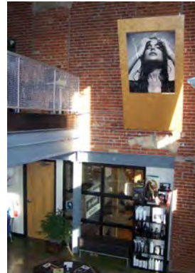
Lobby from above