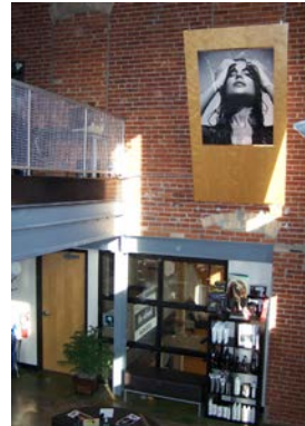
Lobby from above