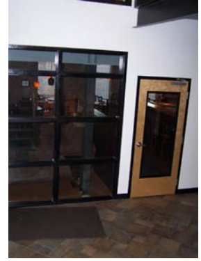
Unit entrance from lobby