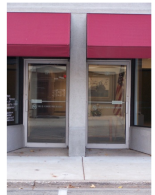
10 th Street building entrance

Located on the first level of the Monroe Professional Center Condominium, Unit 106 is an undeveloped space suitable for development as a professional office.