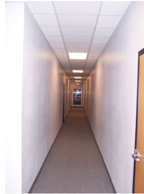
Hallway facing north