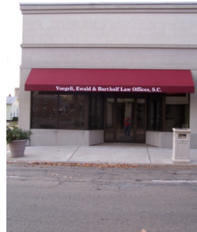
10 th Street exposure