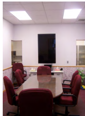
Main conference room