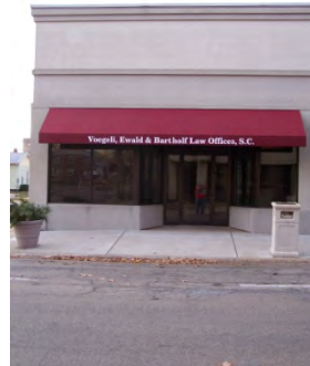
10 th Street exposure