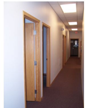
West interior hallway

Located on the first level of the Monroe Professional Center Condominium, Unit 104 is developed as a professional office with three large offices [12' x 13', 12' x 13' & 12' x 13'6"], four smaller offices [each 9' x 9'11"], two conference rooms [11'5" x 17'5" & 9'11" x 15'2"], a spacious clerical and waiting room [12'1" x 44'11"], a handicapped accessible restroom and a storage room [10'6" x 14'2"]. All doors are ADA compliant and of solid core construction. The unit is heated by a high efficiency natural gas furnace. All offices and conference rooms are wired for telephone and computer.