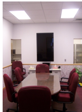
Main conference room