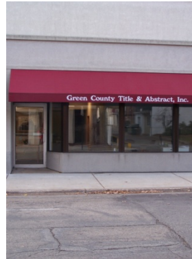
10 th Street exposure