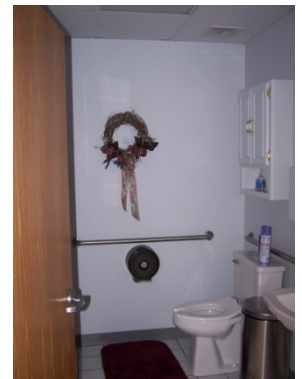
ADA Women's restroom

Located on the first level of the Monroe Professional Center Condominium, Unit 101 is developed as a professional office with two private offices [each 9' x 11'1"], a conference room [18' x 11'1"], a spacious clerical and waiting room [14'9" x 19'1"], men's and women's handicapped accessible restrooms and a large open storage or work room [29'10" x 23'10"]. All doors are ADA compliant and of solid core construction. The unit is heated by a high efficiency natural gas furnace. All offices and conference rooms are wired for telephone and CAT 5E for computer.